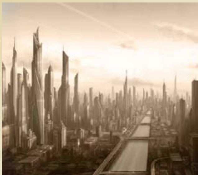
AN ARTIST'S RENDERING OF PROFESSOR EINHARDT'S HYPOTHETICAL CITY ON MARS.