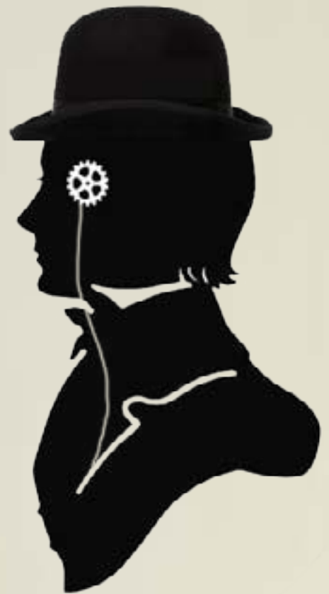
TROPPL E. ARMITAGE, FEATURE COLUMNIST